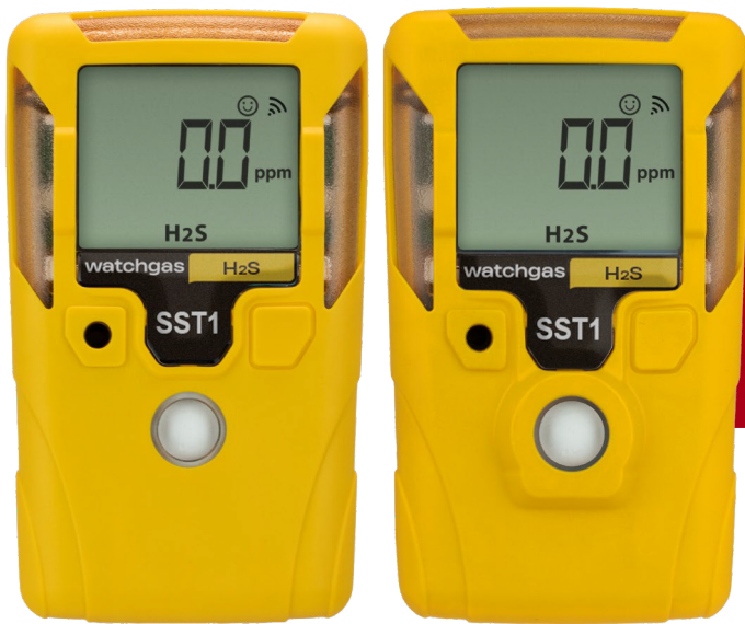
SST1 Micro sensor