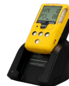
Universal Cradle Charger for SST Range SST-IND-S