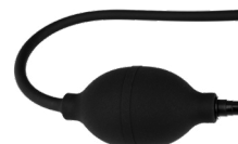
Aspirator Bulb/Pump for Diffusion Models

Advised for use with Last-o-More tubing 7SAC0504