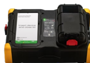
SST Dock SST-DOCK