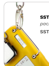
SST4 Lanyard Bar pack of 10 SST4-POUL-10