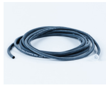
Last-o-More tubing available per meter 5x8mm P/N: 411-0018-039 3x5mm -P/N:411-0018-038