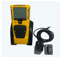
Universal cradle charger for SST Range P/N:SST-IND-S