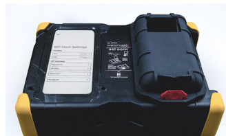
SST Dock P/N:SST-DOCK