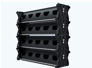
WatchGas SST Range 5-Way Stackable Charging Cradle P/N:SST-STACK-CHR (Extra's are needed)