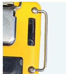
SST4 Lanyard bar (sold separately) P/N:SST4-POUL-10