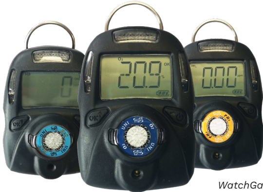
WatchGas UNI Single Gas Detectors

Fully 85% of fire departments in the U.S. consist of all or mostly volunteer personnel. Firefighters and hazmat teams face numerous threats to life and health, some of which demand use of gas detectors to prevent over-exposure, particularly the so-called Toxic Twins: carbon monoxide and hydrogen cyanide. But volunteer fire departments have limited budgets for maintenance and training for these detectors. WatchGas instruments are particularly suited for such departments because of their simple operation and ease of maintenance in lowcost instruments that cover multiple gas detection needs.