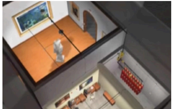
Figure 2: Fixed CO 2 extinguishing system

The use of CO 2 extinguishers requires special safety steps. If those extinguishers are used in closed rooms, all persons must be warned and evacuated in time because of the risk for Oxygen depletion. The danger of suffocation can only be prevented by using SCBA (Self containing breathing apparatus). Unprotected persons must leave the rooms immediately. After use, it must be sufficiently ventilated before people can enter the room again.