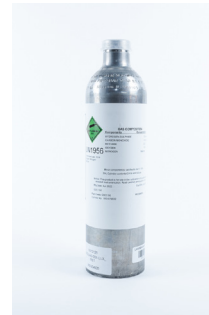
Gas cylinder Ask for availability