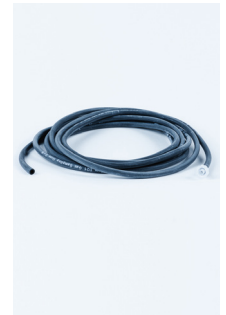
Last-O-More Tubing 3x5 mm per Meter PN: 411-0018-038 Last-O-More Tubing 5x8 mm per Meter PN: 411-0018-039