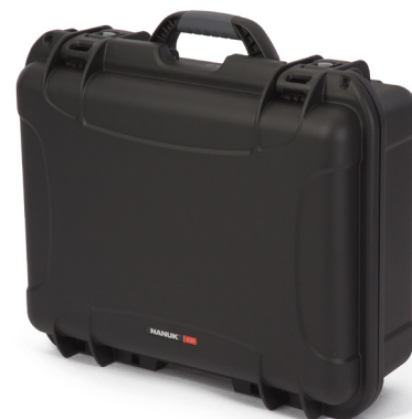
WatchGas SST Docking Station for SST1/SST4/SST4 Pumped in Hard Case with space for 2 Gas Cylinders and DFR PN: SST-DOCK-KIT