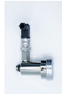
WatchGas SST-Dock D.F. Regulator w/ Pressure Sensor PN: SST-DFRPSV