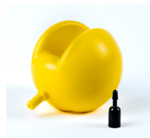
Ballfloat P/N: 7182112