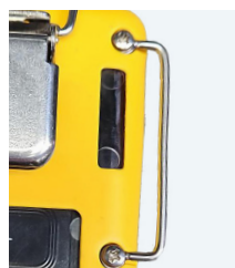
SST4 Lanyard bar (sold separately) P/N: SST4-POUL-10