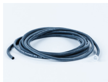
Last-o-More tubing available per meter 5x8mm P/N: 411-0018-039 3x5mm -P/N:411-0018-038