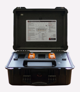
QGM Multi Docking Station