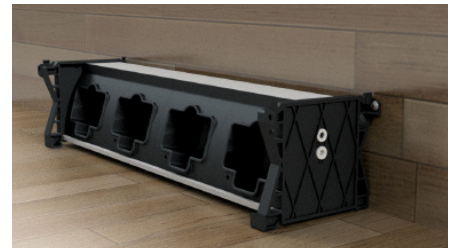
Mount charging cradle to desk or wall use recommended 4.8mm mounting screws

Link up to 4 charging cradles with the (Optional) Link cable (7177215). Connect from output port to second cradle's input port