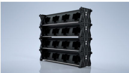
Stackable up to four chargers

Link up to 4 charging cradles with the (Optional) Link cable (7177215). Connect from output port to second cradle's input port