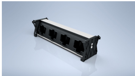
Only use Charger (P/N:7177214) in combination