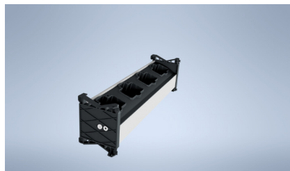
It is also possible to charge up right