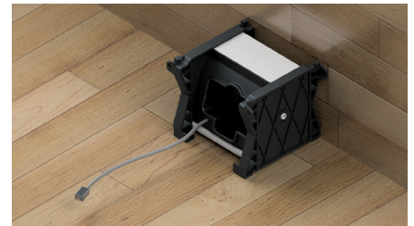
Mount the charging cradle to desk or wall use recommended 4.8mm mounting screws