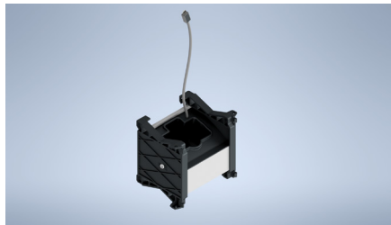
It is also possible to charge up right