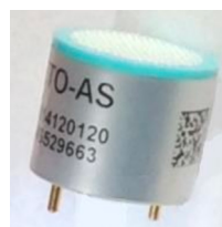
3-Pin Raw Sensor (MUNI)

The data listed below are from the supplier specification sheets and apply to the raw, 3-pin sensors without attached circuitry. In some cases the instrument limits the specifications further. For example, the temperature range for most sensors is -40 to 50°C, whereas most WatchGas instruments have an operating range of -20 to 50°C. In a few instances the measuring range is narrower in the instrument than for the raw sensor, and in some cases the instrument can extend the range to lower values. POLI monitors can accept at most two high-power sensors, which include PID, NDIR and LEL.