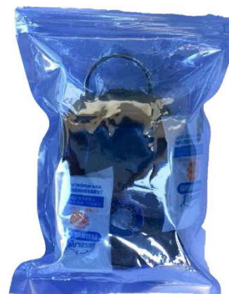
UNI lead-free oxygen monitor in air-tight shipping package with oxygen scavenger packets

Turning the unit off does not save much power if stored in ambient air, because this only turns off the display, which uses much less power than the oxygen cell, which remains on even with the power off. Therefore, storing at reduced oxygen levels is a more effective way to save battery life.