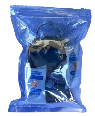
UNI lead-free oxygen monitor in air-tight shipping package with oxygen scavenger packets

Turning the unit off does not save much power if stored in ambient air, because this only turns off the display, which uses much less power than the oxygen cell, which remains on even with the power off. Therefore, storing at reduced oxygen levels is a more effective way to save battery life.